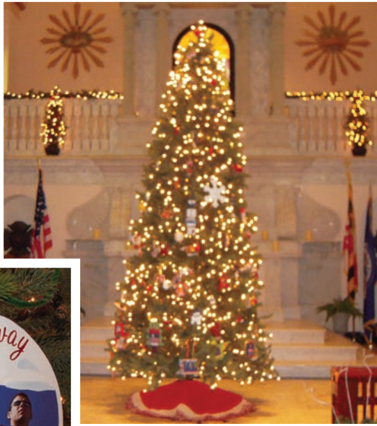
Ornaments made by survivors adorned the Holiday tree in the Fallen Firefighters Memorial Chapel. Survivors are asked to make an ornament.

Throughout the year, and especially during the National Fallen Firefighters Memorial Weekend, survivors help the Foundation with various projects and activities.